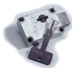
Detention Lock with

Wall or ceiling opening is normal door size plus +5/8" (16mm) For detailed specifications see submittal sheet